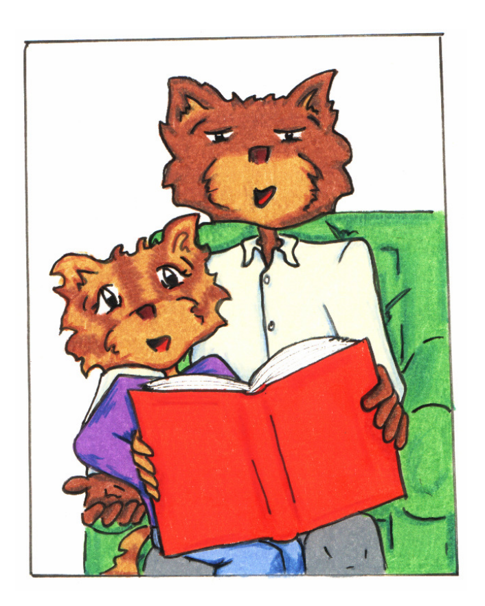
Published by The Youth Law T.E.A.M. of Indiana

This project was supported by Indiana Criminal Justice Institute